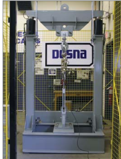
Crane scale calibration test stand at Desna