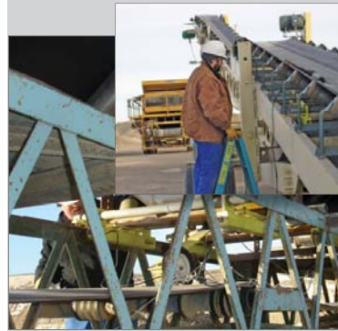
Desna belt scale installation