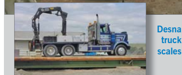
Desna truck scales