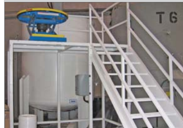
Tank with Desna weighing system