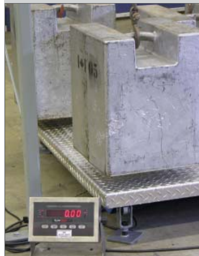
Floor scale calibration test stand at Desna