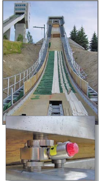
Desna integrated ski jump weighing system