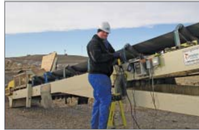
Desna field service