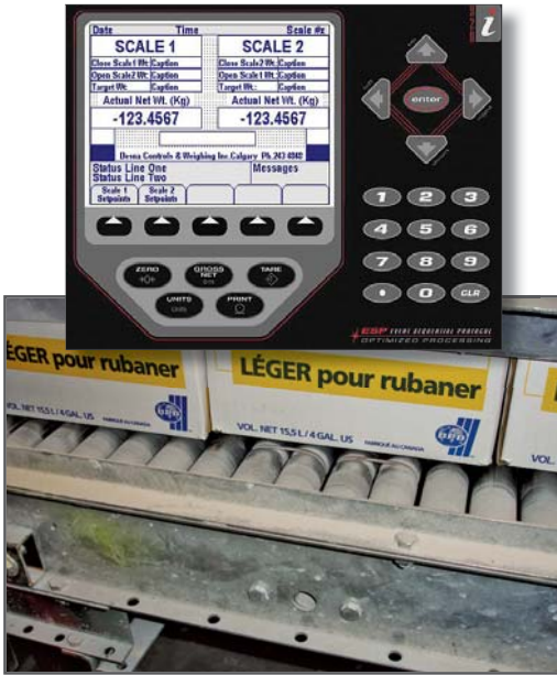
Desna designed scale system for mud filling station