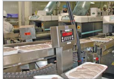
Desna checkweighing application with price labeling and data tracking