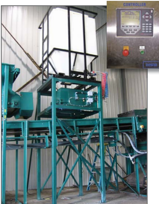
Fertilizer blending system with Desna software to monitor feed rate using load cells