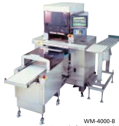
WM-4000-B + PS-EMZ (Infeed conveyor)