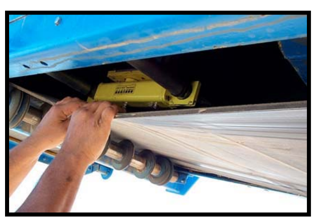
Low-Profile Model - Ideal for Portables