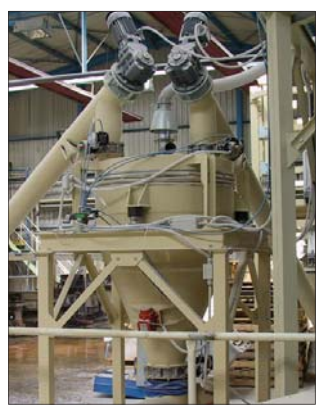
Food processing plant