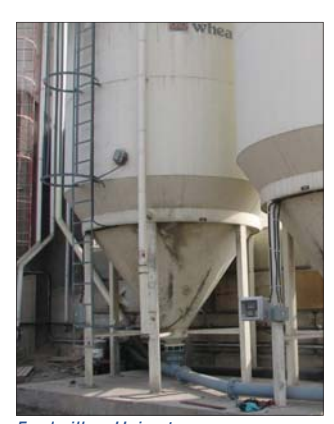
Feedmills – Unicrete