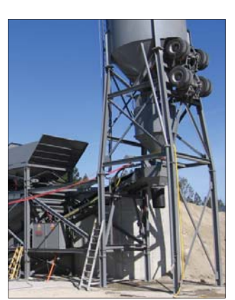
Concrete portable plant