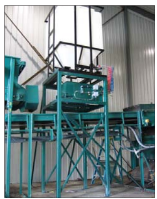
Pet food plant - Natures Call