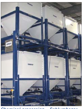
Chemical processing – Schlumbege