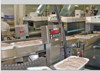
Desna checkweighing application with price labeling and data tracking