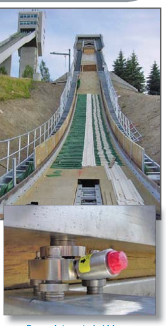
Desna integrated ski jump weighing system