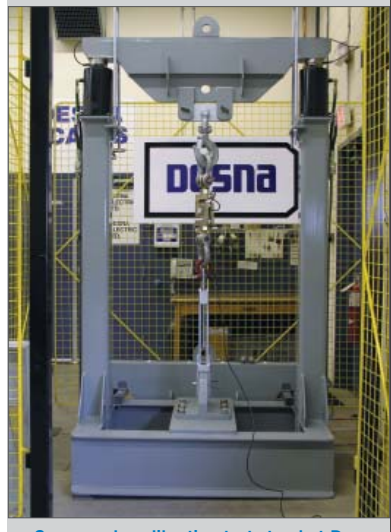
Crane scale calibration test stand at Desna