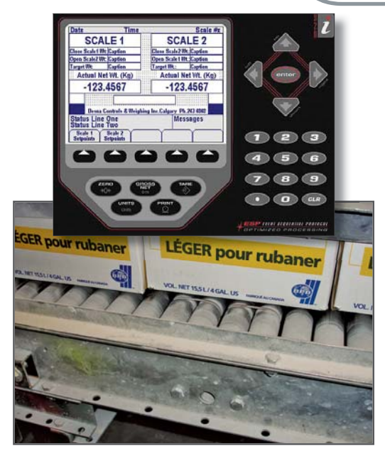
Desna designed scale system for mud filling station