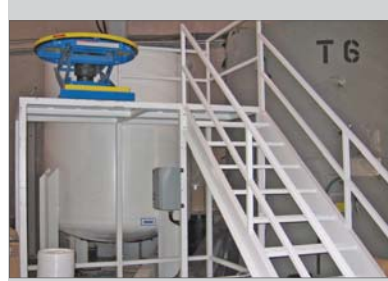
Tank with Desna weighing system