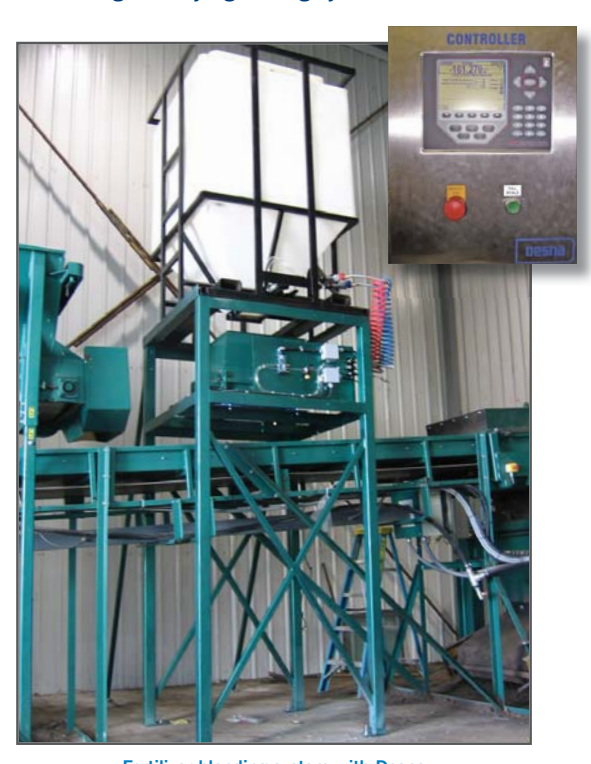
Fertilizer blending system with Desna software to monitor feed rate using load cells