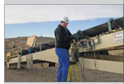
Desna field service