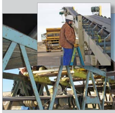
Desna belt scale installation