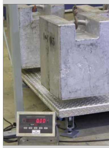
Floor scale calibration test stand at Desna